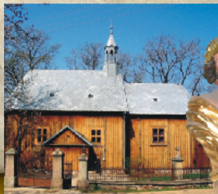
The rich history of Sarbiewo dates back to the Middle Ages