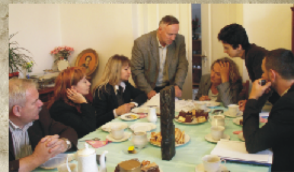
One of working sessions of AES in the presbytery

popularization, AES's museum and organization. Erection of the manor-house would complement already existing, unique Baroque complex in Sarbiewo that comprises of: church, presbytery and graveyard. "Sarbinium" would be the place for the Museum of Baroque, a library, the AES's headquarters, a Polish-Lithuanian inn and a small hotel. The above plans are advocated by numerous organizations including local and regional