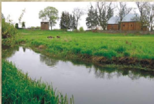
Sarbiewo is an idyllic place...

A lot of effort has been made since 2005 to remind the citizens of Masovia, Poland and Europe about Jesuit priest Maciej Kazimierz Sarbiewski (1595-1640) the first Polish poet of European importance who was honored with Poetic Laurel Wreath in Rome by the pope Urban VIII in 1623 (the award is the equivalent of today's Nobel Prize); the professor of Vilnius Academy and adviser of the king Wladyslaw IV Waza. This greatest poet of the XVII century Europe, who has not been surpassed by any of Polish poets as for the number of translations and publications in the west, was born in Sarbiewo village near Płońsk, is hardly known in his