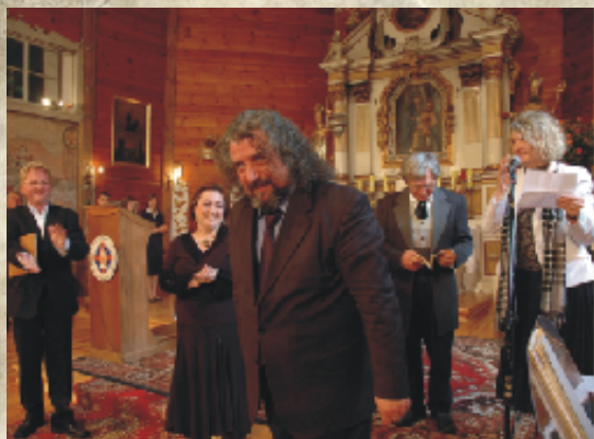
One of concerts in Sarbiewo shrine

the organization of the event. It was the series of happenings including scientific sessions, poetic