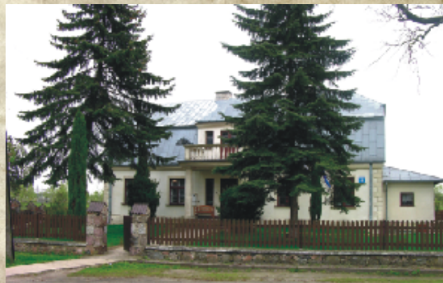
For the time being the headquarter of AES is located in historical presbytery

The initiators of the action established the Academia Europaea Sarbieviana association (AES) in 2006. It was registered in national registry of associations (KRS) on